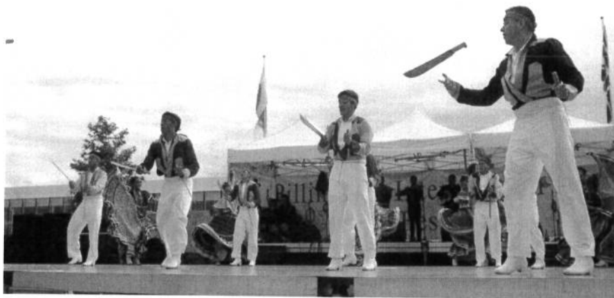
above: Mexican group at Billingham