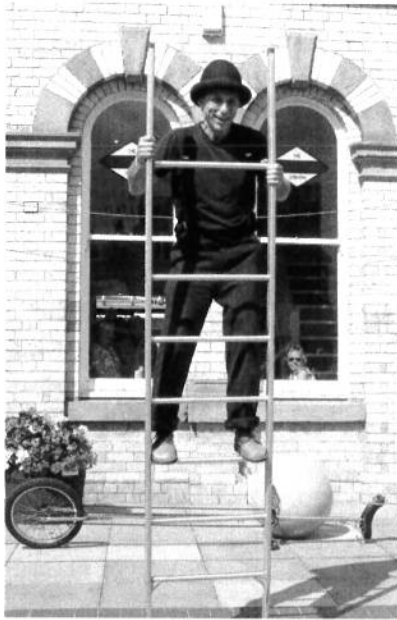
man wobbling about on a ladder (see page 8)